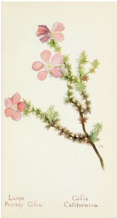
Download Full Pages Read Online Field book western wild flowers Botanical Artists Pinterest Field book western wild flowers Botanical Artists Pinterest Western wild Wild flowers and Westerns