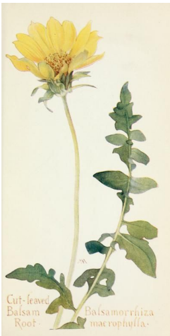
Download Full Pages Read Online Field book western wild flowers Botanical Artists Pinterest Field book western wild flowers