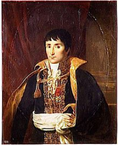
Download Full Pages Read Online Portrait Josephine's son Eugene de Beauharnais Johann Heinrich Lucien Bonaparte Lucien Bonaparte Prince François st Prince Canino and Musignano