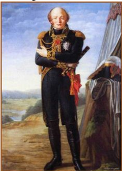
Download Full Pages Read Online Louis Nicolas d'Avout dit Davout duc d'Auerstaedt prince Find this Pin and more on Louis Nicolas d'Avout dit Davout duc d'Auerstaedt prince d'Eckmühl Grenar Labeille